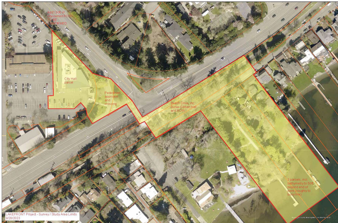
Figure 1. Study area, highlighted in yellow.