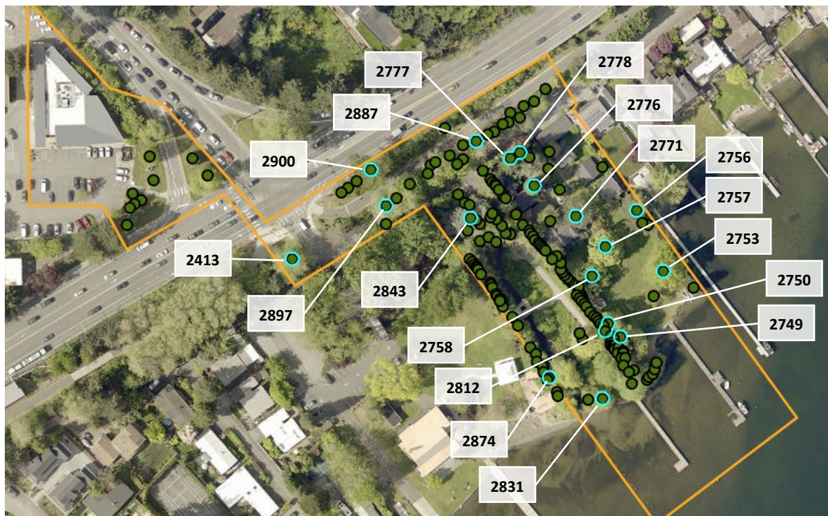
Figure 2. Approximate locations of inventoried landmark trees, highlighted in teal.

Overall, the average DBH of trees within the study area is 14.8-inches. The largest tree (#2756) is a coastal redwood ( Sequoia sempervirens ) with a DBH of 68.9-inches. A total of eighteen significant trees, including tree #2756, meet the definition of a landmark tree, defined as a significant tree measuring at least 24-inches DBH (LFPMC 16.14.030, see Figure 2). No inventoried trees meet size requirements to qualify as an exceptional tree (LFPMC 16.14.030). However, ten trees (trees #2413, 2749, 2756, 2758, 2778, 2831, 2843, 2884, 2879, and 2895) have DBHs measuring 33-inches or larger, the minimum size threshold for exceptional native conifers.