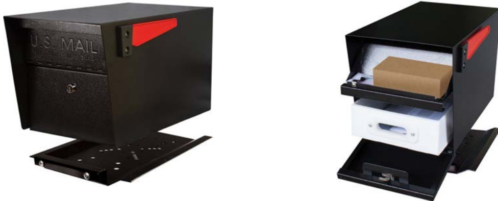
Mail Boss 7500 Mail Manager Pro in black

21"D x 10.75"W x 11.25"H (one size only)