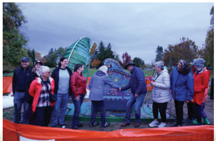
Ribbon Cutting of Art

The Secret Gardens of Lake Forest Park Garden Tour and Plant Sale continues this legacy, funding local nonprofits and public art projects. The next Garden Tour will take place on Saturday, June 20, 2026.