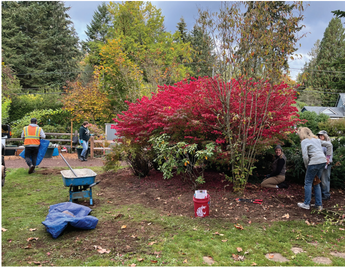
Volunteers creating a Pollinator Garden at Pfingst Animal Acres Park, expanding the Master Gardener Demonstration Garden (Sept–Oct 2024).

The City Council and Mayor's Office officially proclaimed the week of April 20 as National Volunteer Week. Did you know that we have our own dedicated group of volunteers who provide much-needed services for our parks and environment?