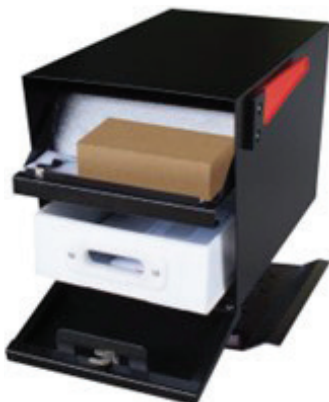
Mail Boss 7500 Mail Manager Pro

Last year, the City began the Locking Mailbox Program [ https://www.cityofflp.gov/682 ] to help deter mail theft.