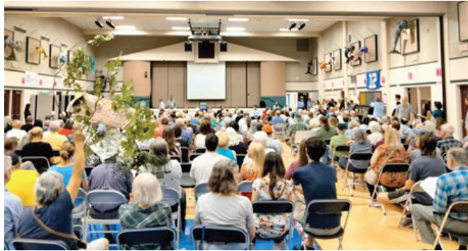
LFP Community Meeting with Sound Transit CEO (2023)