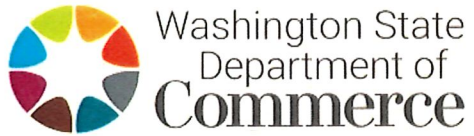
EXHIBIT A to Resolution 24-1941