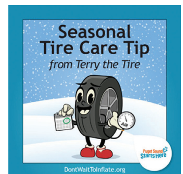
Terry the Tire