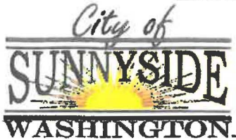
EXHIBIT A to Resolution 23-1928

City of Sunnyside 818 East Edison Avenue Sunnyside, Washington 98944 (509) 836-6305 Office