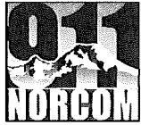
EXHIBIT A to Resolution 23-1917