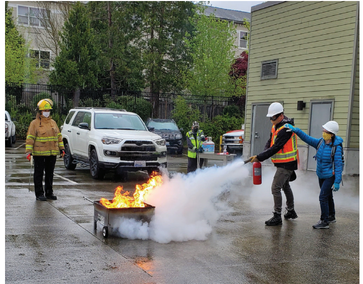
CERT Class 2021

The Radio Amateur Civil Emergency Service (RACES) team, which consists of volunteer ham radio operators,