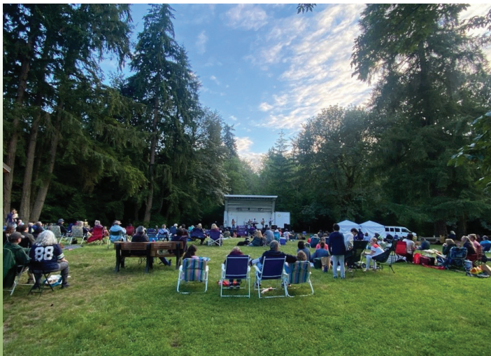
Concert in the Park at Pfingst Animal Acres Park 2022