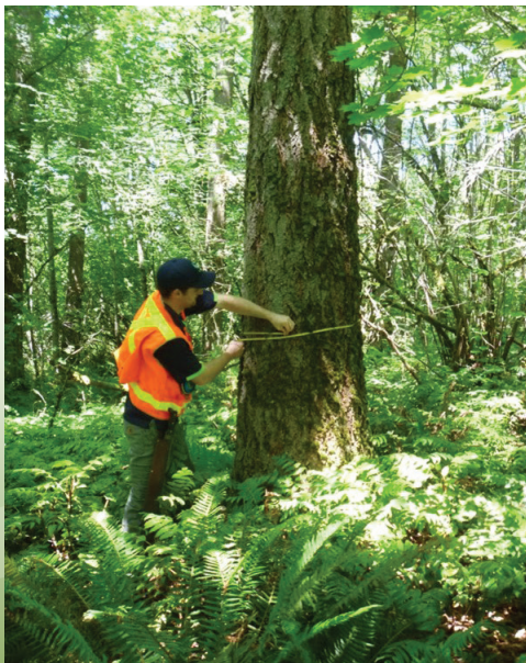
Inventory crew member conducting field work to measure the tree trunk diameter

The City is excited to announce the 10-year update to its citywide tree inventory! This effort will evaluate the health and composition of trees in the City's community forest, which includes trees within parks and open spaces, street trees, as well as trees on private land. Together, these trees serve an important role in mitigating climate change. They provide shade that reduces the urban heat island effect, capture and filter stormwater runoff, sequester carbon, increase home values, improve human health and wellness, and create habitat for wildlife. The data collected from this inventory provides critical information to preserve, restore, and enhance our community forest.