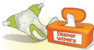
Disposable diapers, nursing pads & baby wipes