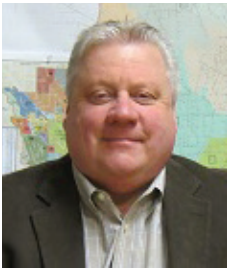
Mayor Jeff Johnson

At its meeting on July 22, the City Council took action to place LFP Proposition 1 on the November 2, 2021, election ballot. LFP Proposition 1 asks voters if they wish to raise property taxes through a levy lid lift to provide reliable funding for the development, operation, and maintenance of parks, recreation and open spaces, trails, sidewalks,