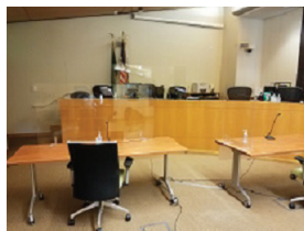
Protective partitioning at the dais