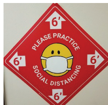
Social distancing reminder