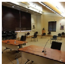
Social distancing in courtroom/council chambers