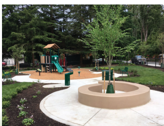
Eagle Scout Park

The City is seeking applications for several positions on both the Lake Forest Park Tree Board and Parks and Recreation Advisory Board.