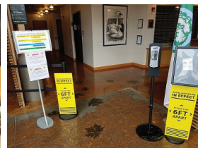
City Hall lobby signage