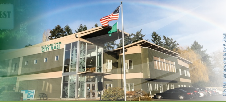
City Hall rainbow

A publication of the City of Lake Forest Park • www.cityofflp.com • 206-368-5440 • 17425 Ballinger Way NE • Lake Forest Park, WA 98155