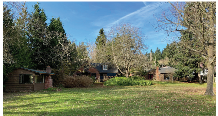
Lake Haven property