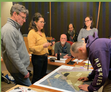
January Planning Commission meeting

The Planning Commission has begun making recommendations to the Council on portions of the Town Center Code Update. On February 11, 2020, the Commission held a public hearing on the draft regulations for stand-alone parking structures in the Town Center. Around 50 people attended the hearing and 27 individuals provided verbal comments. The audio recording of the hearing is available on the Town Center Process page of the City website ( https://www.cityofflp.com/593/Town-Center-Process ).