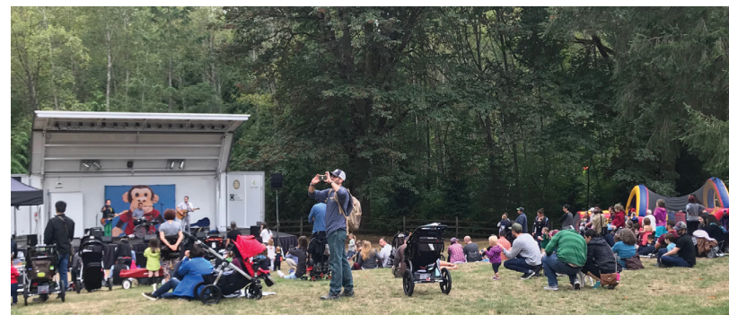
Picnic in the Park 2018