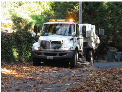
LFP Street Sweeper

Avoid blowing leaves into the street. Our street sweeper can only pick up and carry a small number, when compared to the piles of leaves on all the streets of LFP. Be