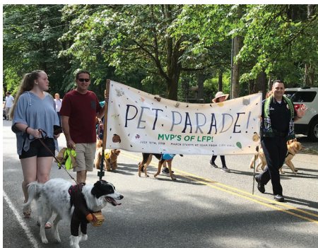
Pet Pawrade 2019

I hope you all had a great summer and had a chance to join us for one or more of the summer events held right here in town. This year's Pet Pawrade was a huge success—