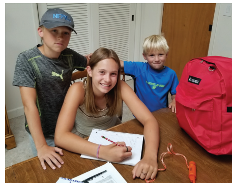
Working on the family emergency plan

for collecting the children? Does your babysitter know how to shut off your home's utilities? When everyone has input and you talk through your plan you will find areas unique to you and your family.