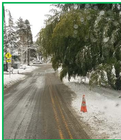
One lane blocked on Brookside Blvd. NE, near the Fire Station

The recent storms brought to light many examples of vegetation from private property that encroached into the right-of-way—affecting the City's ability to plow and creating sightline hazards for those who chose to keep their cars off the roads and walk instead. Please help us and your neighbors by keeping trees and shrubs trimmed to 12 feet above the walkway and street surface so the community can enjoy the walkways and have a clear sightline of traffic.