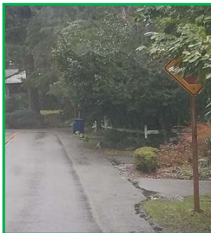
Can You See the Stop Ahead Sign?