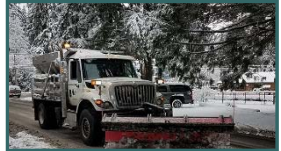
Plowing and More Plowing