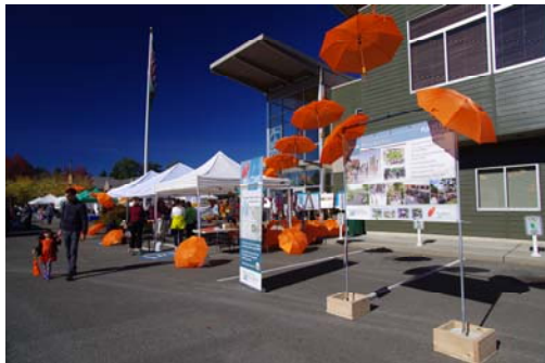
Town Center Vision Outdoor Open House

In addition to the October 14 event, comments were collected at a public scoping meeting held on October 10. Both events were during the published 30-day comment period, which