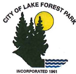
EXHIBIT A TO RESOLUTION 1639

City of Lake Forest Park and Rabanco, Ltd. dba Republic Services of Bellevue