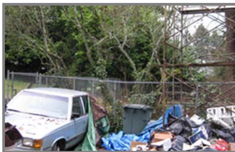
What do you do if your neighbor's property looks like this?