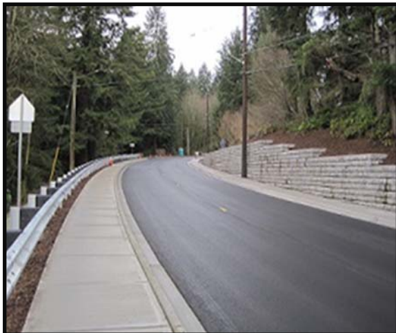
NE 178th Street at 33rd Avenue NE