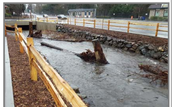
Lyon Creek Flood Mitigation Project

More to come on that topic in future newsletters.