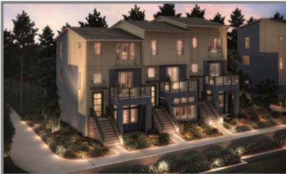
Rendering of multifamily homes—12 Degrees North

The first live/work townhouses at 12 Degrees North are nearly complete! The new neighborhood will eventually have 86 townhouses and 27 single-family houses. The live/work townhouses along the entrance street include an ADA-accessible space on the first floor that can be used for office or retail purposes. The neighborhood is located at the former Elk's Lodge property, between NE 145 th Street and NE 147 th