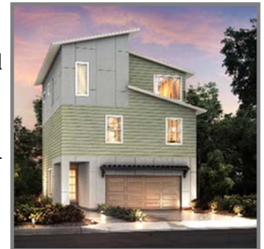
Rendering of single-family home 12 Degrees North

ern Gateway Corridor zone. One building is proposed to include 16 condominium units and the other, 34 apartments. Sign up to receive public notice announcements from Planning. Go to the City's website,